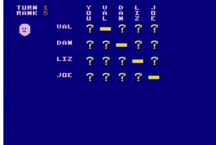
Fig. 2. Screenshots of Gossip. (Left) The main game screen showing two characters talking on the phone. Dan is telling the player that Liz likes them. (Right) The pause menu that displays the player's knowledge of how characters feel about each other and the player. Question marks indicate unknown knowledge and are replaces with the appropriate facial expression when players interact with characters.